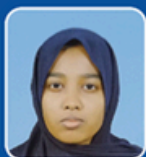
BUSINESS COMMUNICATION 1 (CS1) SUBJECT 2022 OCTOBER EXAM MOHAMMED ALI FATHIMA ASHFA