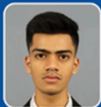
BUSINESS LAW (BL3) SUBJECT 2021 JUNE EXAM M.R.M YOONUS