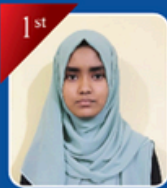
1 st in order of merit Prize M.I.F Hikma